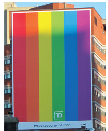
Ad promoting TD's Pride sponsorship.

TD's "Make It Better" video was created to bring attention to the issues of bullying and harassment and let LGBTQA teenagers know that they are not alone.