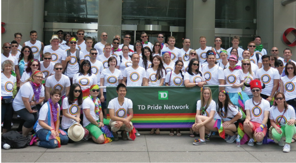
At TD, pride is valued and acknowledged every day.